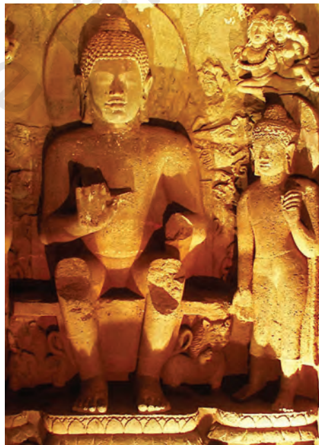
The Buddha teaching (Ajanta caves)

The Buddha started teaching what he had realised, including the idea of ahimsa, which is generally translated as ‘non-violence’, but originally means ‘non-hurting’ or ‘non-injuring’. He also insisted on a sincere inner discipline. The following saying of his expresses this simply: