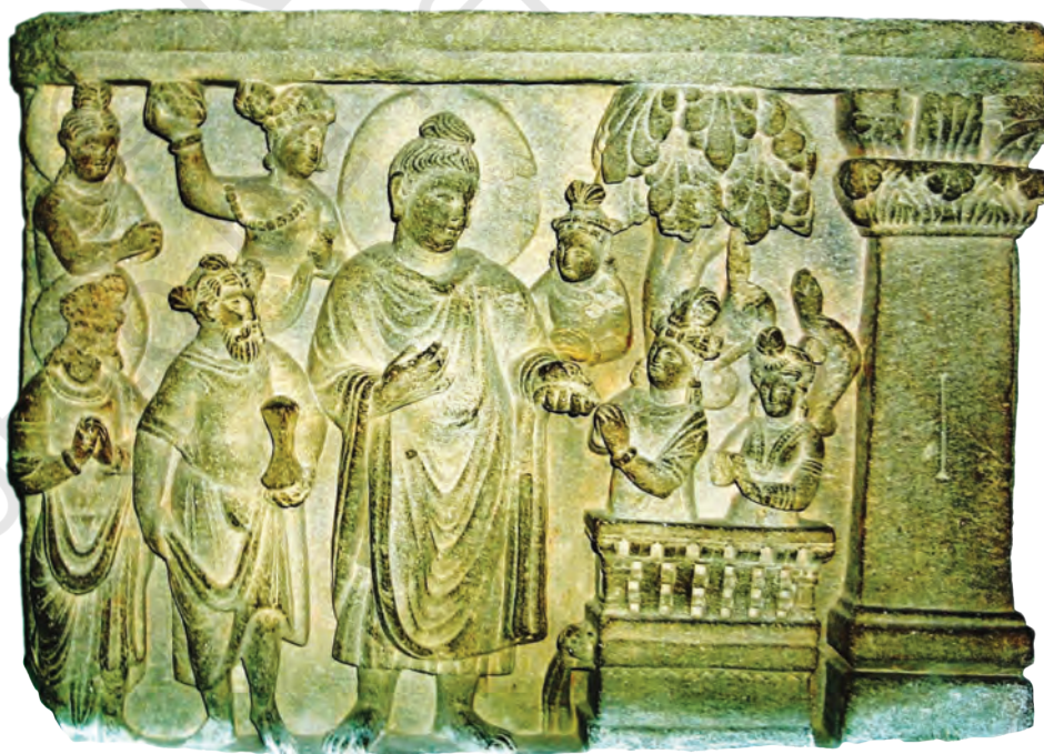
This stone panel, some 1,800 years old, shows the Buddha teaching.

The Buddha founded the Sangha, a community of bhikṣhus or monks (and, later, bhikṣhunīs or nuns ) who dedicated themselves to practising and spreading his teachings. His influence on India, and indeed the whole of Asia, was enormous, as we will discover later; it is still perceptible today.