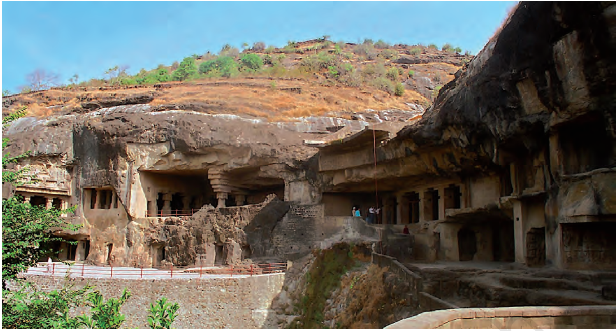
Caves cut into the rock at Ellora (Maharashtra) between the 6 th and the 10 th centuries CE. Some of the caves are Hindu, others are Buddhist and Jain.