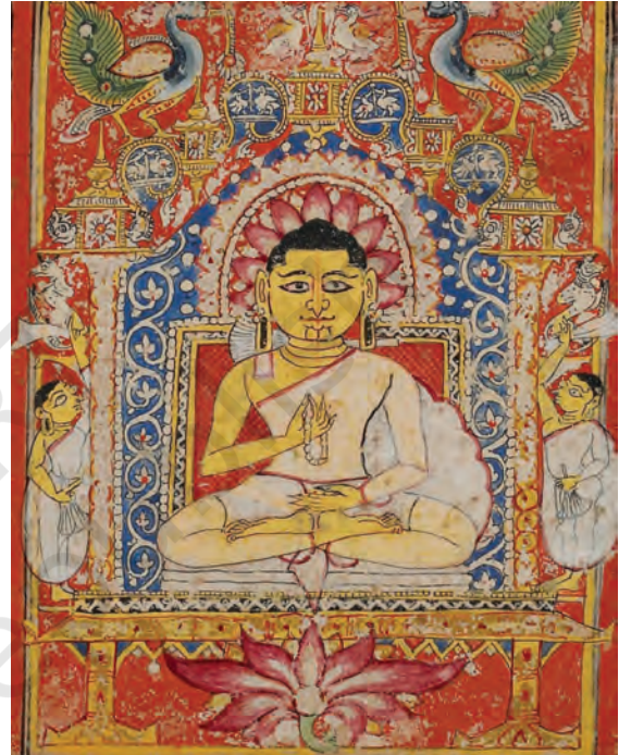
A traditional painting of Mahāvīra

Jainism is another important school of thought that became widespread at the same time, although its roots are said to be much more ancient. Just like Siddhārtha Gautama, Prince Vardhamāna was born into a royal family in the early 6 th century BCE. His birthplace was near the city of Vaiśālī, in modern-day Bihar. At the age of 30, he decided to leave his home and go in search of spiritual knowledge. He practised an ascetic discipline and, after 12 years, achieved 'infinite knowledge' or supreme wisdom. He became known as 'Mahāvīra', or 'great hero', and started preaching what he had realised.