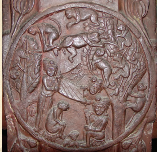
A stone panel (at Bharhut in Madhya Pradesh) depicting the story of the monkey-king

The king, who watched the scene from a distance, was greatly moved by the monkey-king's selfless sacrifice. He thought about the role of a king with respect to his subjects.